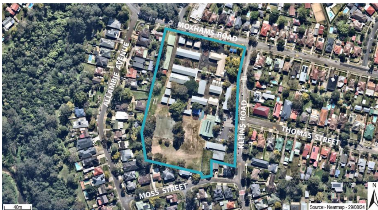
Figure 1 - Aerial Photograph of the Site